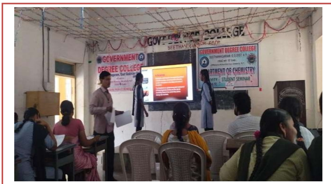
Power Point Presentation