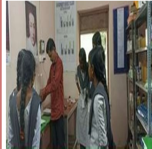
Presentation of Practical Video's