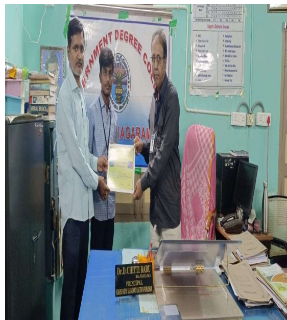
Distribution of Certificates